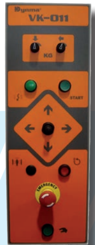
Simplified control panel for "ECO" version.

Copyright 2015. Desarrollo Industrial de Maquinaria Benicarló S.L. The information contained in this document is subjected to change and it is not binding.